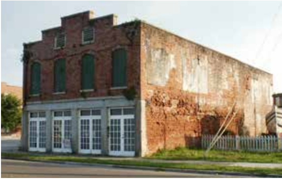
The Historic Sponge Exchange now serves as the City's Center of History, Culture and Art and is an example of a brick commercial warehouse design.