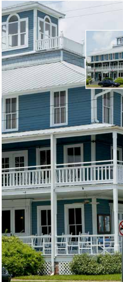
Architectural screening approaches for elevated structures may take the form of open or enclosed panels of various sizes such as the lattice-work shown on the historic Gibson Inn. The panels can be designed to cover the foundation areas. Small panel treatments may include new lattice patterns or other designs for projects with limited elevation.

Historic Structures , (May 2008), Federal Emergency Management Agency National Flood Insurance Program, FEMA P-467-2