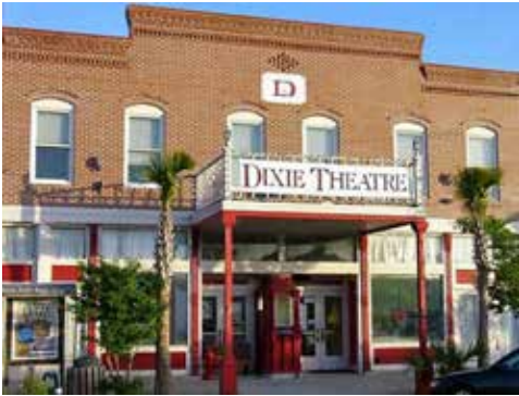
The Historic Dixie Theatre is an example of a mixed use historic brick commercial warehouse design.