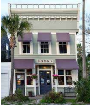
This downtown business building is an example of a two story vernacular wood frame structure.