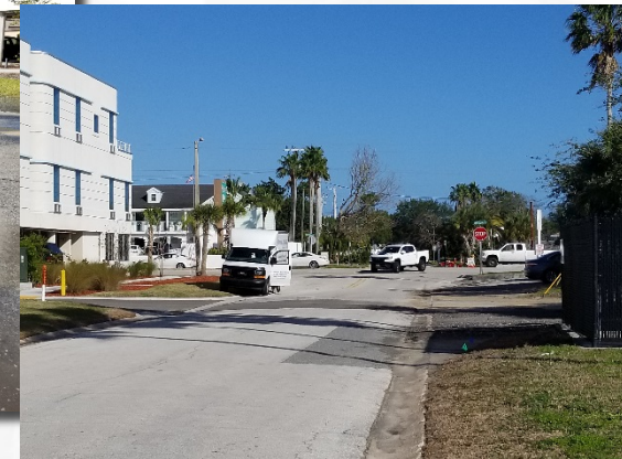
Dry roadway after one-way tidal valve installation