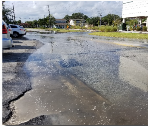
Nuisance flooding prior to one-way tidal valve installation