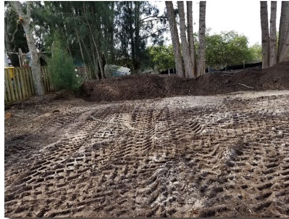
Coquina Park grading work