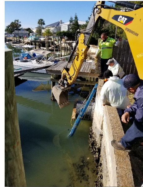
City installation of one-way tidal valve in FDOT outfall