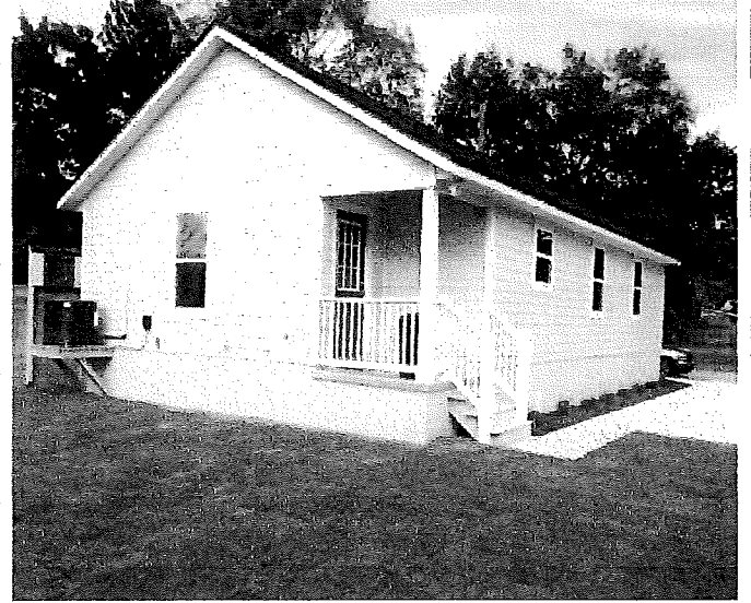
LEFT AND REAR