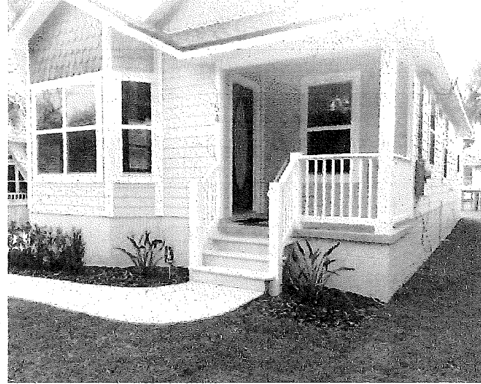
FRONT AND RIGHT