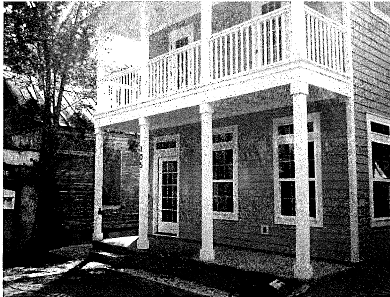
REAR VIEW 4/9/13