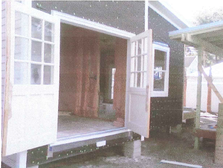
REAR VIEW 2/24/10