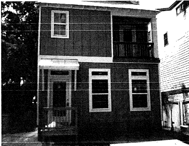
REAR VIEW 7/4/14