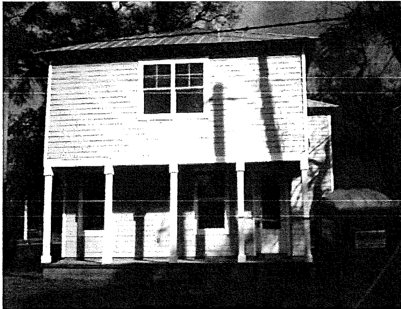
REAR VIEW 3/15/14