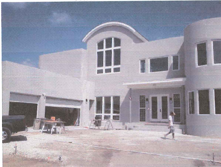
REAR VIEW 7/6/12