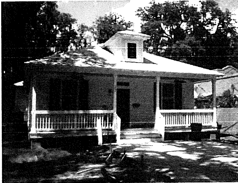
REAR VIEW 4/29/14