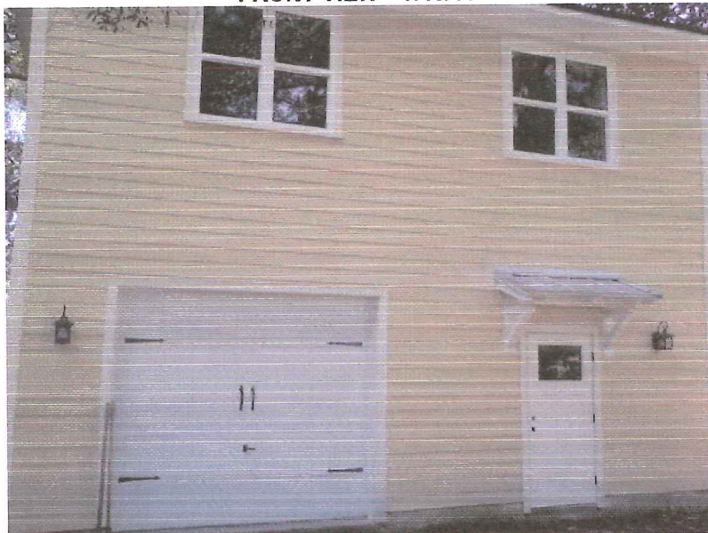
REAR VIEW 7/13/11