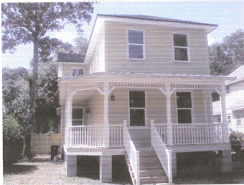
REAR VIEW 7/13/11