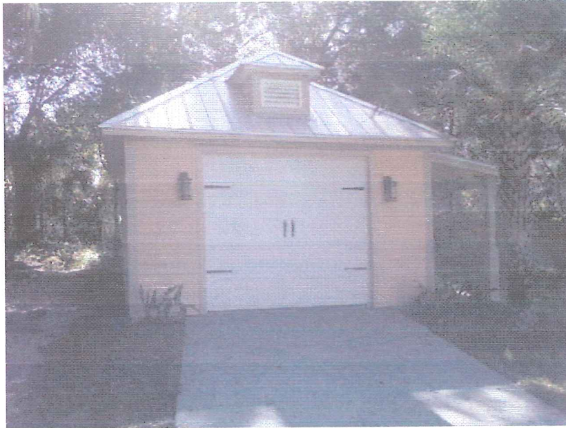
REAR VIEW 11/23/10