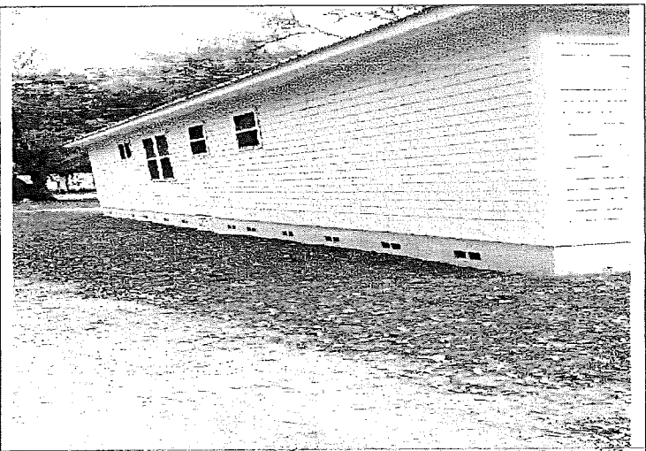
RIGHT SIDE OF HOUSE