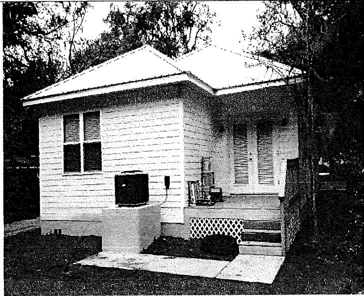
BACK OF HOUSE & A/C