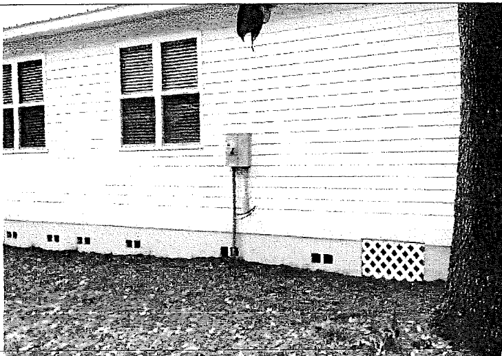
LEFT SIDE OF HOUSE